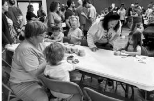
Thank you to everyone who helped with the Egg Hunt. It was great to see the Fellowship Center filled with families from the community!